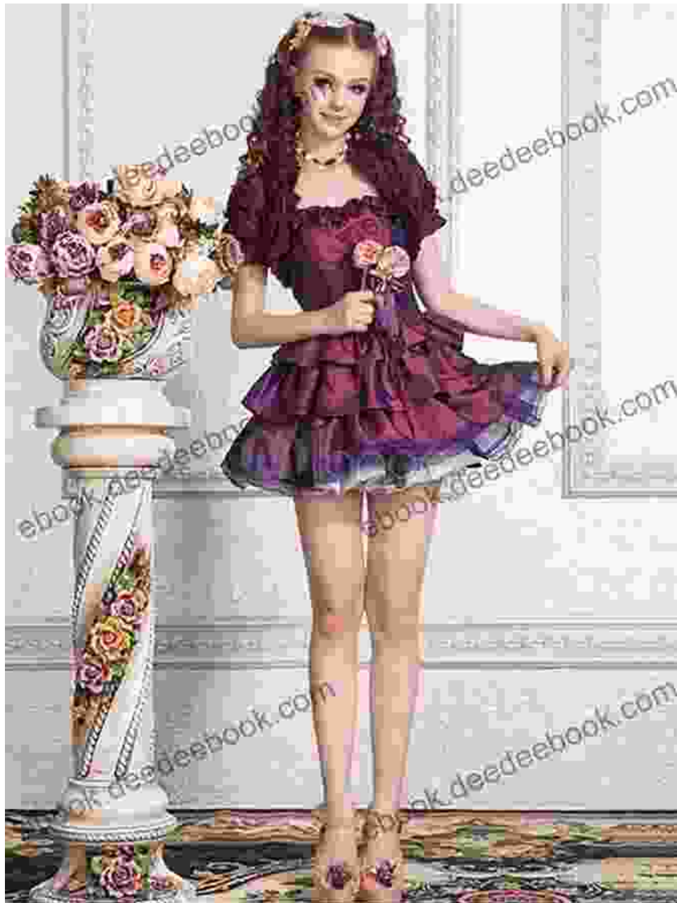
Image: A young woman dressed in a Lolita costume