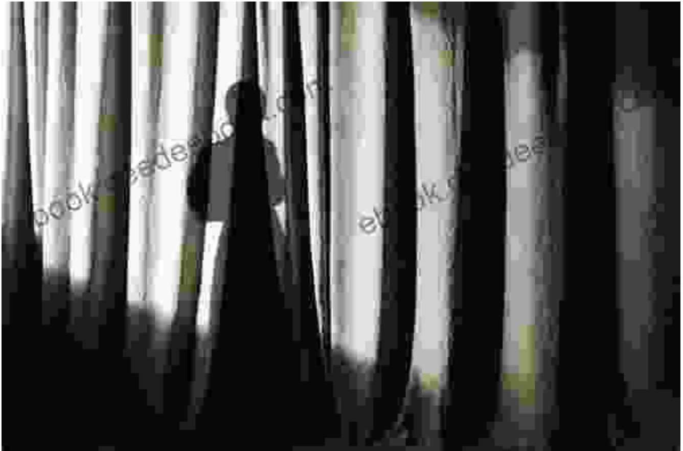
Image: Metaphorical representation of hidden powers influencing world affairs

Whether these powers are benevolent or malevolent, their actions have a profound impact on all of us. It is up to us as individuals to be informed, to think critically, and to hold those in power accountable. By ng so, we can ensure that the shadows of power do not consume our future.