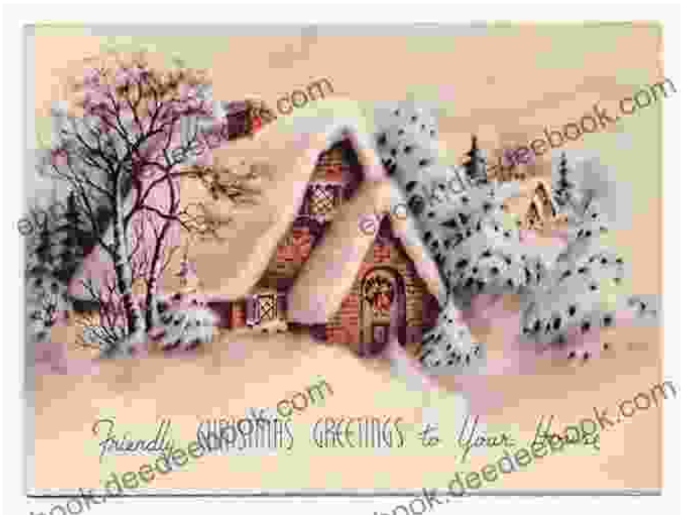
Winter-themed hand embroidery design

As winter's icy embrace descends, transform your home into a cozy haven with hand-embroidered pieces that evoke the magic of a snow-covered wonderland. Embroider shimmering snowflakes, twinkling stars, and adorable snowmen to create a festive atmosphere.