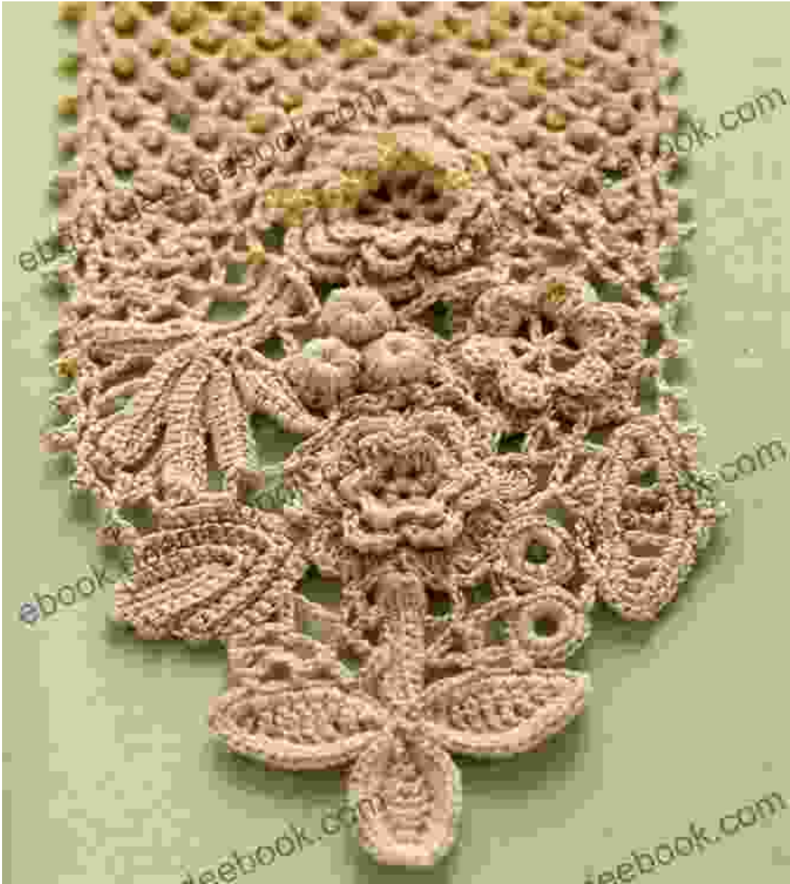
Detailed and intricate lace design with picots, chains, and slip stitches