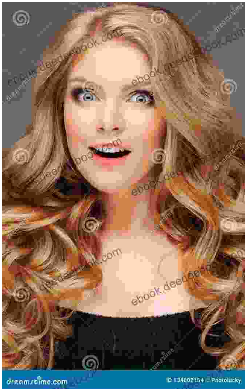
The Girl with the Flaxen Hair

"The Girl with the Flaxen Hair" is a delicate and evocative piece that captures the innocence and beauty of a young girl. Debussy's spare melody and subtle harmonies create an intimate and personal atmosphere.